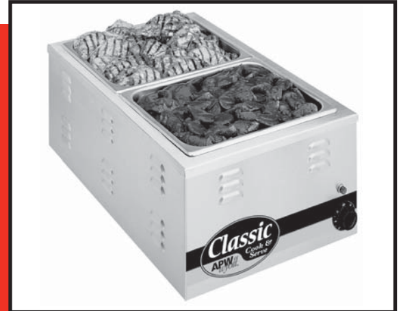
MODEL W-3V COUNTERTOP WARMER